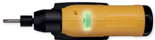
Direct feedback with big LED.

of the battery and gives a low battery warning. A buzzer can be activated to make the feedback even more clear. These features verify your tightening results and give you peace of mind.