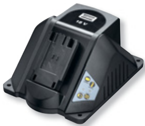
Battery charger 18 V.