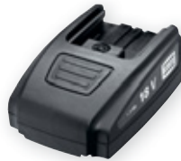
Battery 18 V, 1.3 Ah.