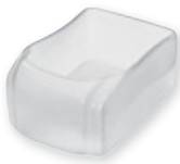
Battery cover 18 V, 2.6 Ah.