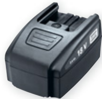
Battery 18 V, 2.6 Ah.