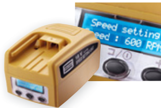
Speed setting unit